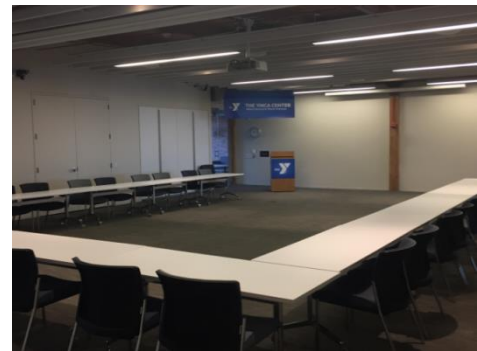
Collaboration & Innovation Center Room

This conference room comfortably seats 16 and is ideal for mid-sized groups. Presentations are beautifully displayed on a flat-screen.