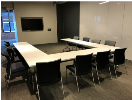
Y Room 2

This conference room comfortably seats 30 and is a modern, one-of-a-kind space great for hosting a meeting or event. Presentations are beautifully displayed using an overhead projector and large auto-retractable screen.