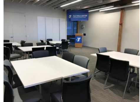
Y Room 1

This conference room comfortably seats 8 and is fully equipped to accommodate your meeting needs. Presentations are beautifully displayed on a flat-screen.